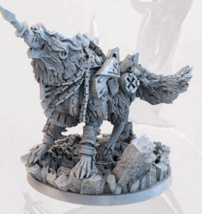
FENRIR BOSS MINIATURE